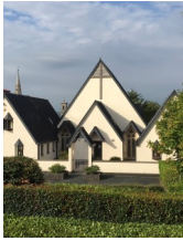
St. Joseph's Raglan Road Devonport PL1 4NQ

Part of the Plymouth Roman Catholic Diocesan Trust - Registered Charity No. 213227