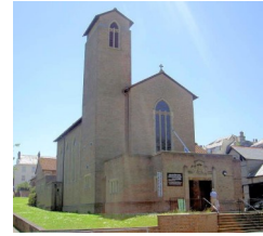
Christ the King Armada Way PL1 2EN