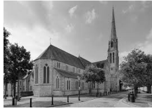
Cathedral 45 Cecil Street Stonehouse PL1 5HW