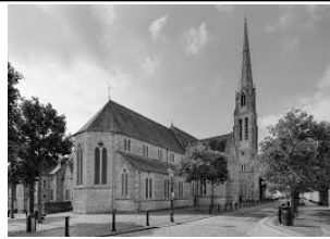
Cathedral 45 Cecil Street Stonehouse PL1 5HW