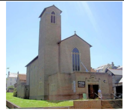
Christ the King Armada Way PL1 2EN