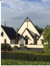
St. Joseph's Raglan Road Devonport PL1 4NQ

Part of the Plymouth Roman Catholic Diocesan Trust - Registered Charity No. 213227