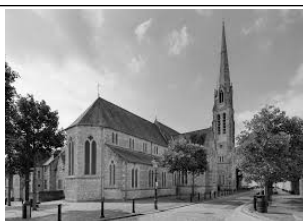
Cathedral 45 Cecil Street Stonehouse PL1 5HW