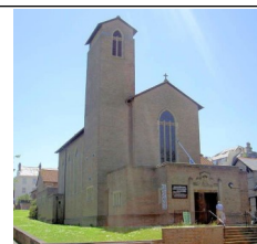
Christ the King Armada Way PL1 2EN