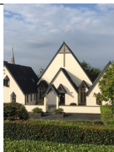
St. Joseph's Raglan Road Devonport PL1 4NQ

Part of the Plymouth Roman Catholic Diocesan Trust - Registered Charity No. 213227