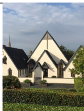
St. Joseph's Raglan Road Devonport PL1 4NQ

Part of the Plymouth Roman Catholic Diocesan Trust - Registered Charity No. 213227