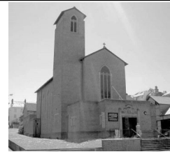
Christ the King Armada Way PL1 2EN