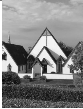
St. Joseph's Raglan Road Devonport PL1 4NQ

Part of the Plymouth Roman Catholic Diocesan Trust - Registered Charity No. 213227