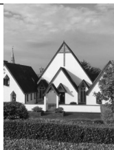
St. Joseph's Raglan Road Devonport PL1 4NQ

Part of the Plymouth Roman Catholic Diocesan Trust - Registered Charity No. 213227