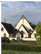
St. Joseph's Raglan Road Devonport PL1 4NQ

Part of the Plymouth Roman Catholic Diocesan Trust - Registered Charity No. 213227