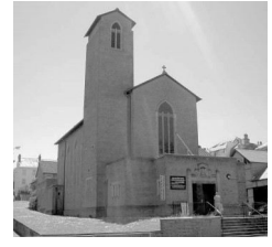
Christ the King Armada Way PL1 2EN