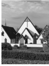
St. Joseph's Raglan Road Devonport PL1 4NQ

Part of the Plymouth Roman Catholic Diocesan Trust - Registered Charity No. 213227