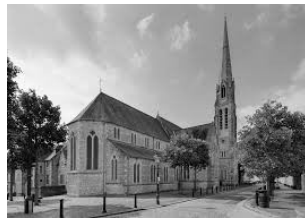
Cathedral 45 Cecil Street Stonehouse PL1 5HW