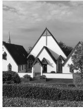
St. Joseph's Raglan Road Devonport PL1 4NQ

Part of the Plymouth Roman Catholic Diocesan Trust - Registered Charity No. 213227