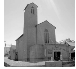
Christ the King Armada Way PL1 2EN