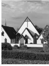
St. Joseph's Raglan Road Devonport PL1 4NQ

Part of the Plymouth Roman Catholic Diocesan Trust - Registered Charity No. 213227